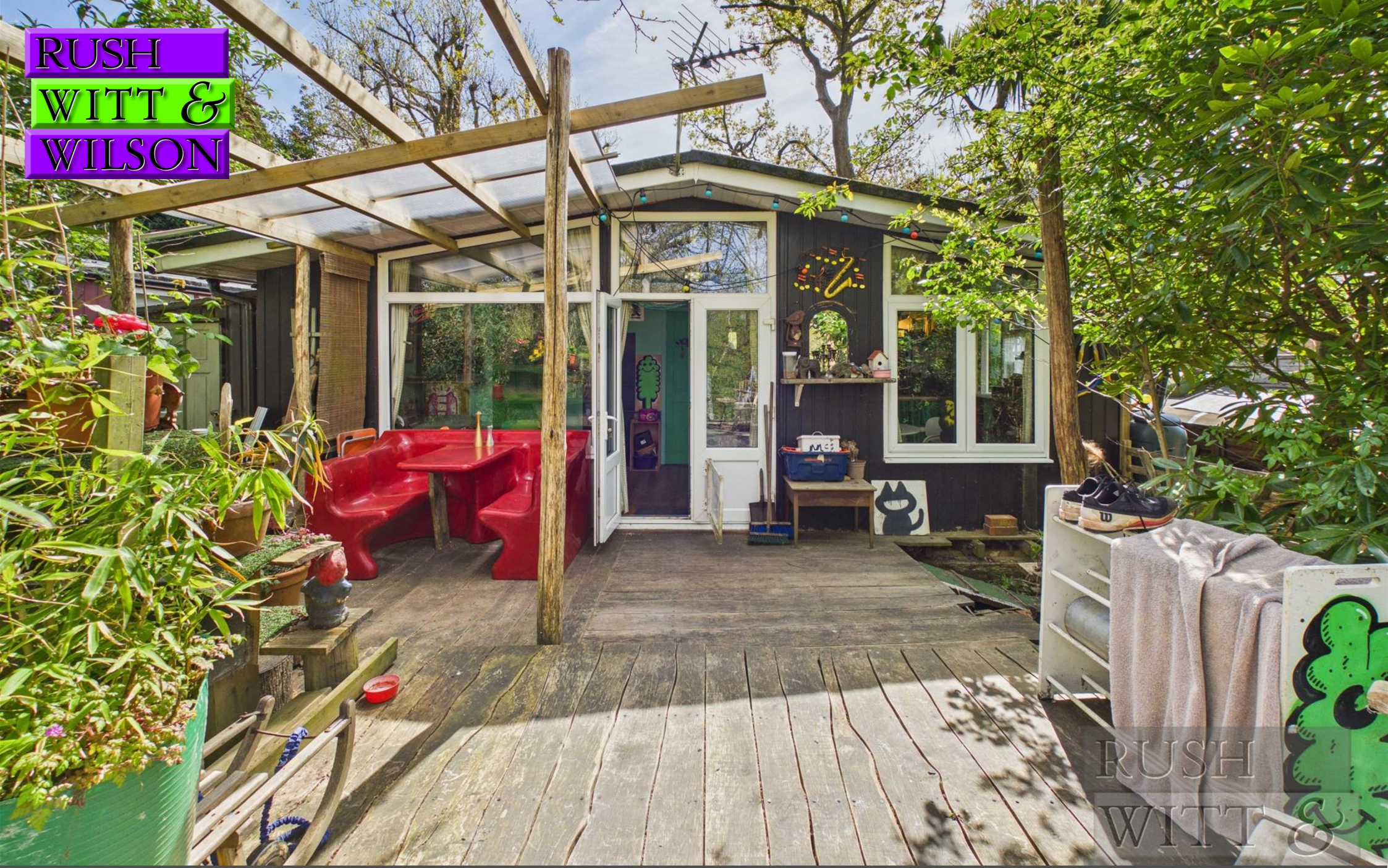
85 High Beech Chalet Park Battle Road, St. Leonards on Sea, TN37 7BS Guide Price £200,000 Freehold